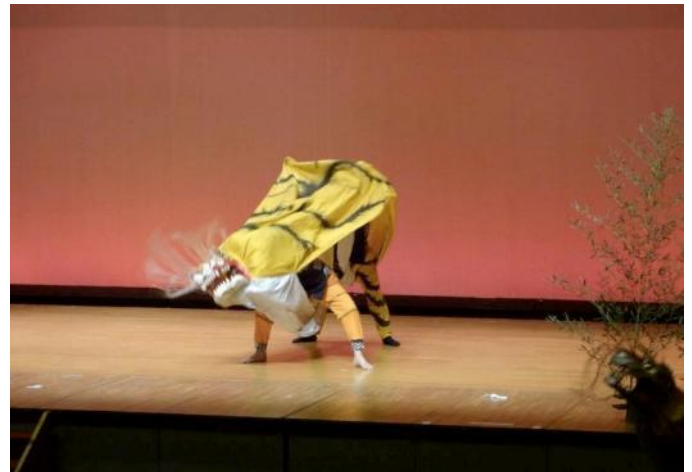
Tora-mai (Tiger dance)

*** Popoki's friends in Kobe sent cards to their friends in Otsuchi-cho on 11 March.