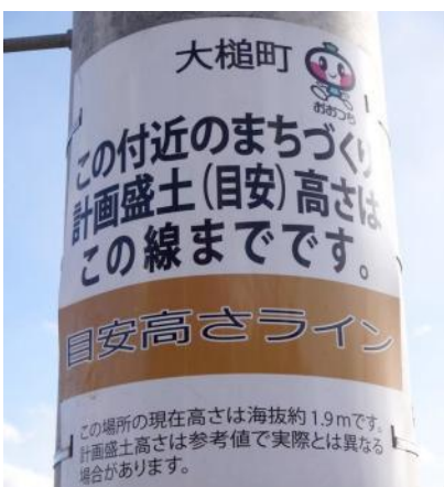
The gold line on this pole shows the approximate height to which land must be raised for construction. It is about 1.9 meters.