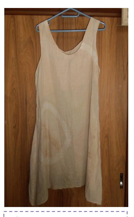
(↑)The butterbur sprout color and a butterbur (↓)

The 3.11 disaster have given us a chance to re-think our lifestyle and values, etc. Everyone has a different way of facing the situation. People show their minds in various ways and actions, or seek answers in various 'voices' around them. Using natural dyes may one of the ways to hear the voice of plants. The connection between plants and humans is interesting and mysterious. The colors produced from natural dyes are kind and soft colors. These are inner colors which we cannot see from outside. Natural dying is like chatting secretly with plants. The meeting with Aya san and natural dyes gave me a chance to meet plants. I hope all of you also have a chance to experience this wonder!