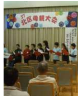
← Popoki at Hyogo International High School 10.16