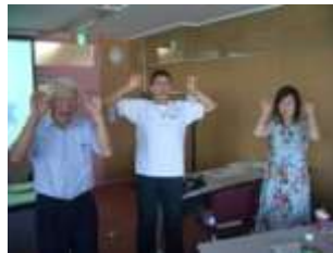
Popoki at the '24 th Cultural Salon' 9.26