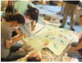
← Workshop at NPO W·I·N·G—Michi-wo-hakobu— Tamariba 9.5