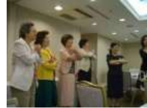
Popoki at PSSEAWA (Pan-Pacific & SE Asia Women's Association of Japan) 9.7 Osaka Granvia Hotel