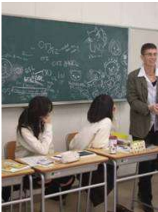
Popoki at the 37 th Kita-ku Mothers' Association Gathering Shiawase no Mura 10.25 →