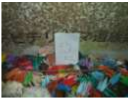
Popoki in Okinawa 9.25