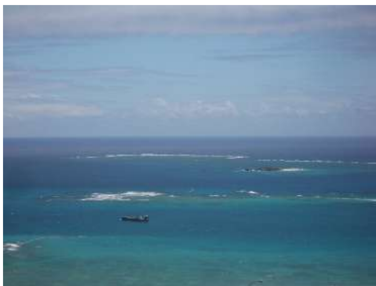
Photo: Looking off the southern coast of Okinawa Island (Ronni, 2009.9)