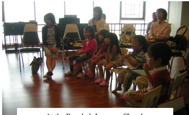
At the Bangkok Japanese Church

My assignment, as a theologian, was to give 'a sermon' at the worship for children to precede the worship for adults at the Bangkok Japanese Church. All through the time of preparation, I was inspired by vivid images of the 'Color of Peace' that I