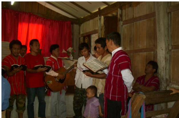
At the church in the village of Karen tribe

In the history of Christianity there are, in fact, times that it chased away 'other colors,' and enlarged itself all over the world, even though 'Christianity' is only a single 'one of the colors.' Unfortunately there was not time or a chance for me to share about that kind of issue with the children. But I pray that I will be able to lead to such a thing someday.