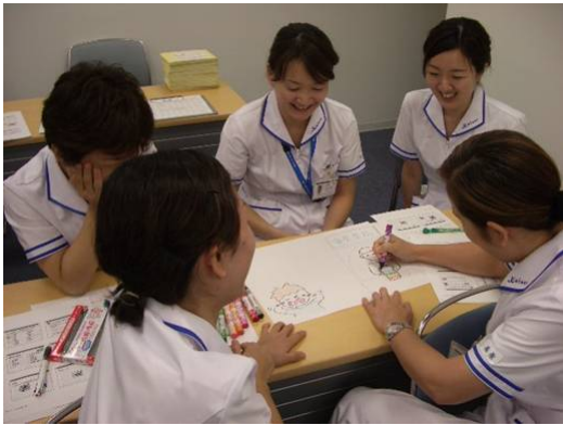
8.31 Workshop at Kobe Kaisei Hospital