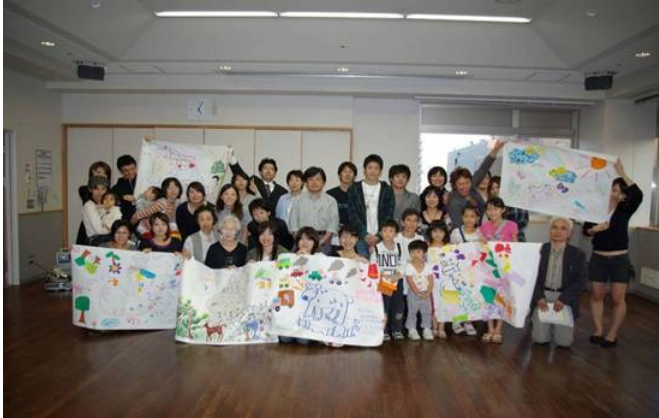
Popoki in Niigata! (10.6)