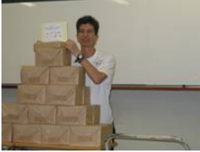
5.15 The book is finally released!