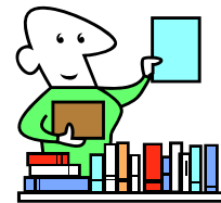
YMCA Japan gave a copy of the book to each participating YMCA National Council