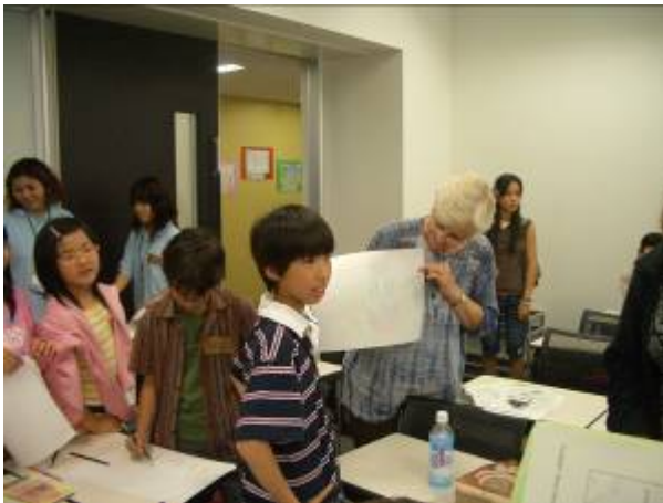
Peace as a Global Language (Imagine Peace) 10.28